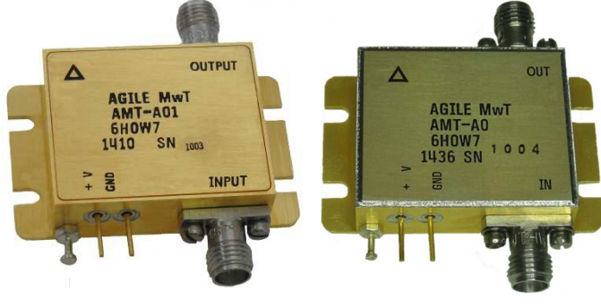
Laser Sealed Hermetic